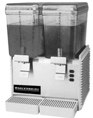
MSD20 Two 3 Gallon Bowls