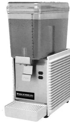
MSD10 One 3 Gallon Bowl

Consistency - MAXX SERVE's rotary system continuously circulates the product to ensure a fresh and consistent drink every time.