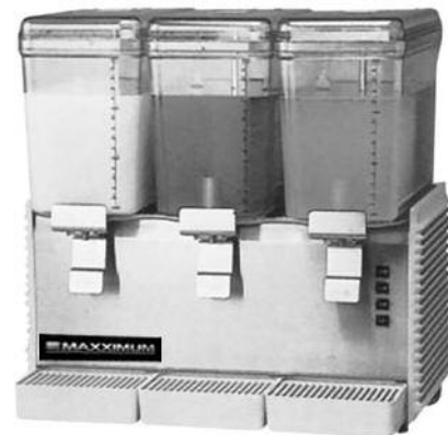
MSD30 Three 3 Gallon Bowls